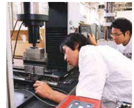
Bending Test of Metallic Materials