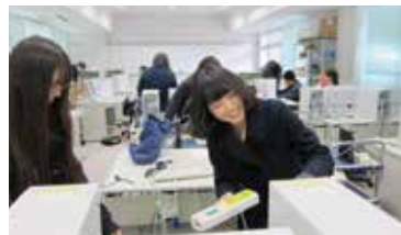
Computer Network Experiment