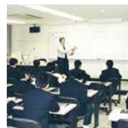
Learning English by a Native Speaker