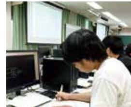
Lecture (logic circuits)