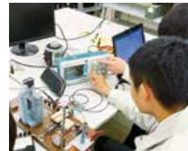
Experiment of Electronics