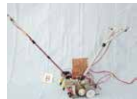
An Autonomous Robot