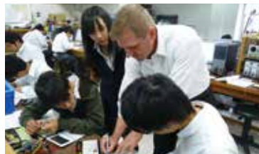
Fundamental Electronic Circuit Experiments in English