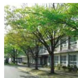
Department of General Education