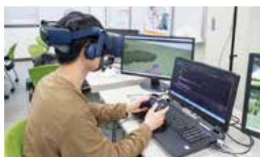
3D Content Creation for Virtual Reality