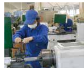
Working with Lathe Machine