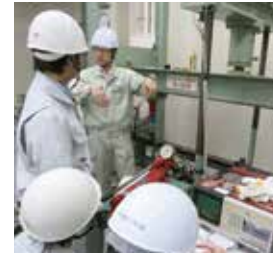
Loading of steel structure