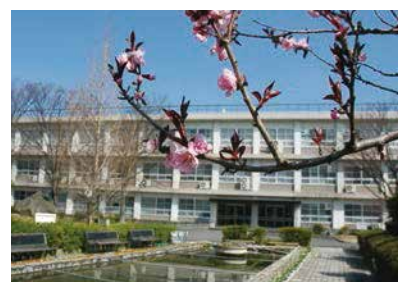
Department of General Education in Spring