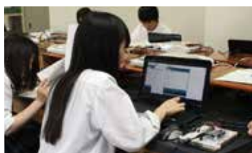
Digital Circuit Experiment