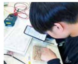
Presentation of Circuit Design