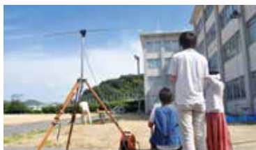
Wireless Communication Experiment