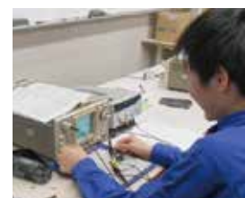
Checking Electronic Components