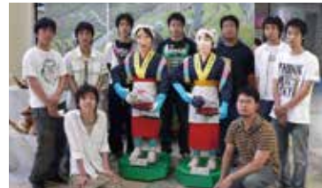
Graduation Work with Region Cooperation (in 5th Grade)