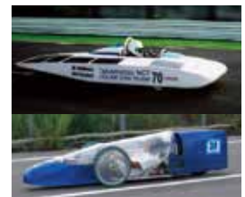
Solar Car and Eco Car