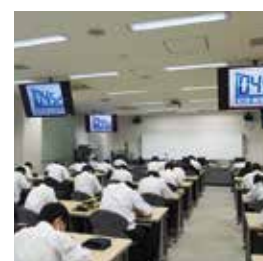
A Lesson in the Multimedia Room