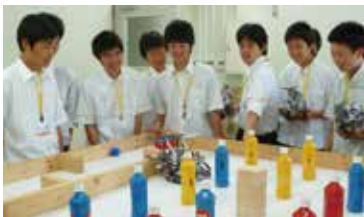
Robot Manufacture Experiment using MINDSTORMS