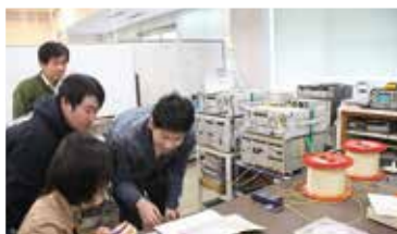
Optical Fiber Communication