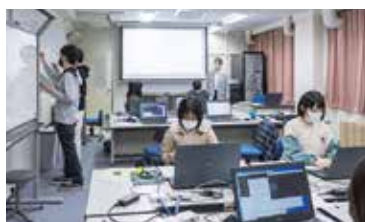
Network System Integration