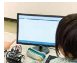
Practice of Information Processing