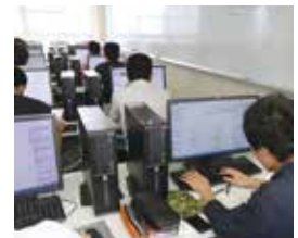
Computer Aided Design & Drafting