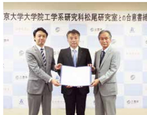
Conclusion of the Agreement of Cooperation between Mitoyo Matsuo Laboratory of the University of Tokyo and NITKC (August 2018, Mitoyo City Hall)

The division will actively provide educational programs about AI and its underlying data science courses to all the students of the National Institute of Technology colleges by using the educational and research resources of the University of Tokyo's Matsuo Laboratory and NITKC's research achievements.