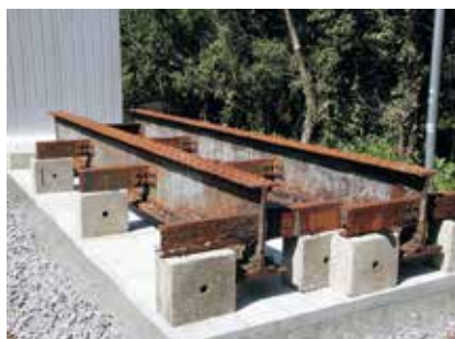
Steel rivet girder