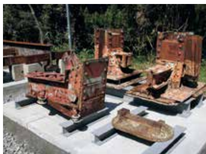
Steel truss bridge and supports