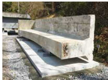
Reinforced concrete girder