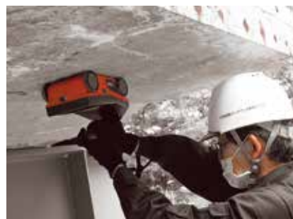
Non-destructive inspection by electromagnetic wave radar