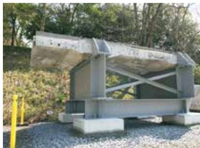
Reinforced concrete slab