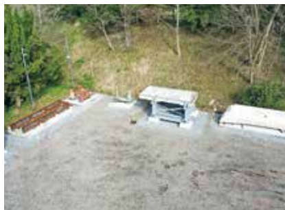
Overview of the space

Following structural members collected from actual deteriorated bridges were placed in practical training facility for infrastructures.