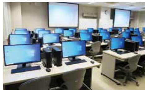
Takuma Campus Advanced Information Lab

Automatically-recoverable computers are installed in Advanced Information Lab, and are used for education on computer literacy and academic research. All of the students can connect their BYOD PC to the campus network with wired or wireless LAN in Second Seminar Room, Cyber Lab, and Multimedia Learning Lab.