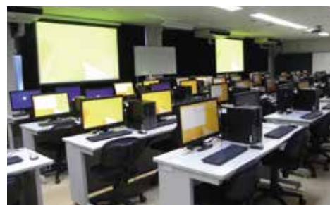
Takamatsu Campus Second Training Room

Automatically-recoverable computers are installed in the facilities and are used for education on computer literacy and academic research. 47 client computers for the first training room; 50 client computers for the second training room; 18 client computers for the third training room; and 54 client computers for the multimedia room.