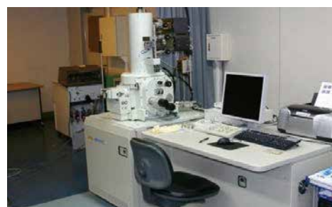
Scanning Electron Microscope

This office consists of the Collaborative Education Center of Emerging Technology and the Cooperative Research & Development Center. Each center has many laboratories and a lot of equipment. These are used for students' experiment programs, the experiments for the graduation thesis of the associate degree, the cooperative research, and the commissioned research. The equipment is as follows: X-ray diffraction system for thin-film crystalline analysis; X-ray fluorescence spectrometer; Absorption spectrophotometer; Tabletop microscope; Ellipsometer; Scanning probe microscope; Scanning electron microscope; Finite element analysis system; Thermography camera; RF magnetron sputtering system; Fume hood; Digital Microscope; Atomic force microscope; Surface profiler.